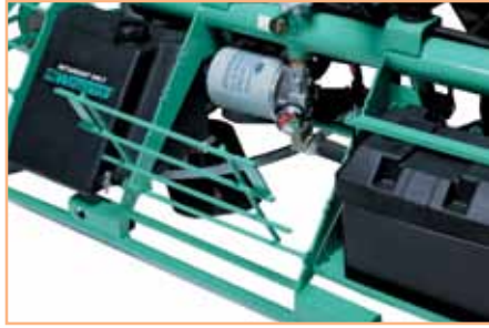
Hinged panels make servicing easy by allowing quick access to filters and trowel blades