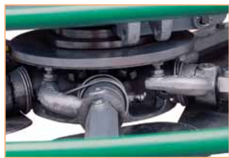
Spider assemblies feature long-lasting wear plates and spider hubs