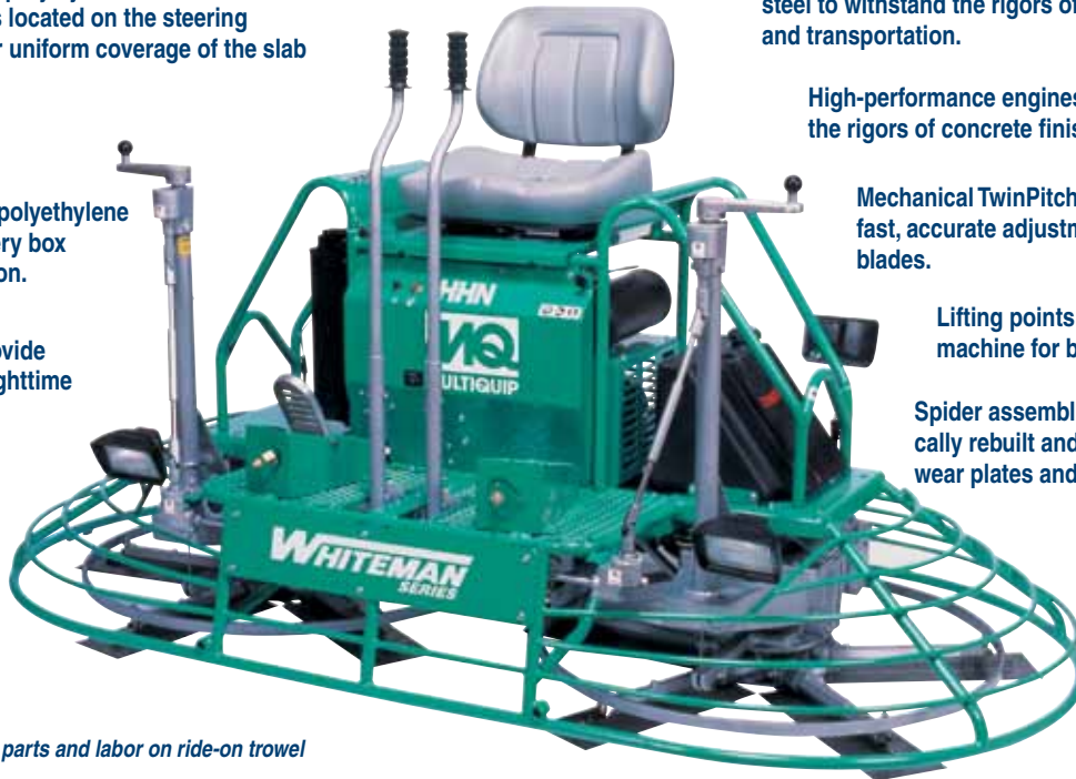
(HHN shown. Called-out features typical of all mechanical trowels.)

Spider assemblies can be economically rebuilt and feature long-lasting wear plates and spider hubs.