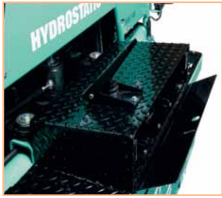
Raised operator's platform includes lockable storage compartment