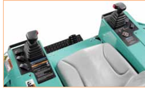
Operator Controls are ergonomically designed and positioned for ease of use.