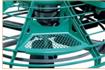
Removable steps provide quick access to trowel blades