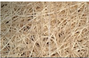
Erosion Control Blankets