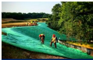
Turf Reinforcement Mats