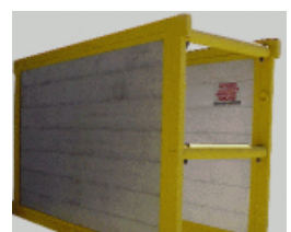
Steel Framed Panels