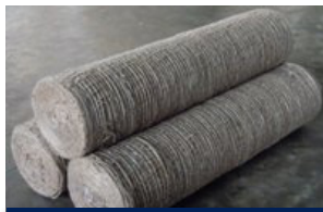
Jute & Coir Mats